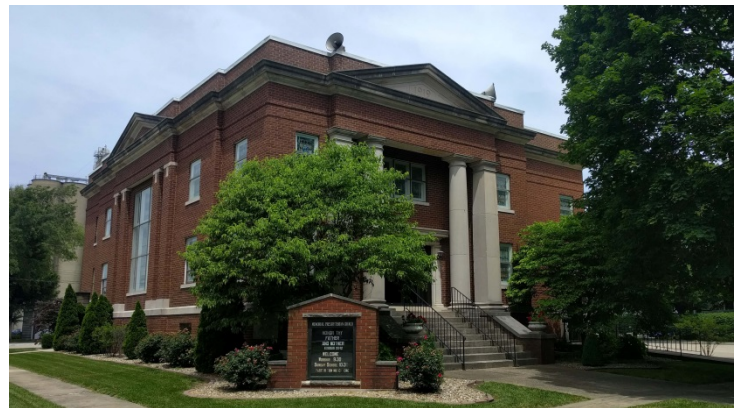
Spring Gathering, April 27! Memorial Presbyterian Church, Assumption, Illinois

Driving Directions: Take US Rt. 51 to Assumption. Take one of the turns off the Rt. 51 bypass into the town. From the north, continue into town on College Ave. (2600 East Rd./Old Rt. 51) Turn right (west) onto North Street; there is a sign for Memorial Presbyterian Church. Go a couple of long blocks and you will see the church at 303 N. Locust St. From the south, take the first street into the town and continue on College Ave. (2600 East Rd./Old Rt. 51) to North Street, where you will turn left (west), and continue to the church at 303 N. Locust St.