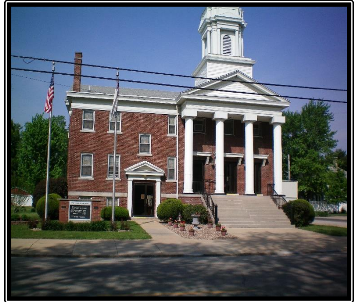
New Church...1921 to present